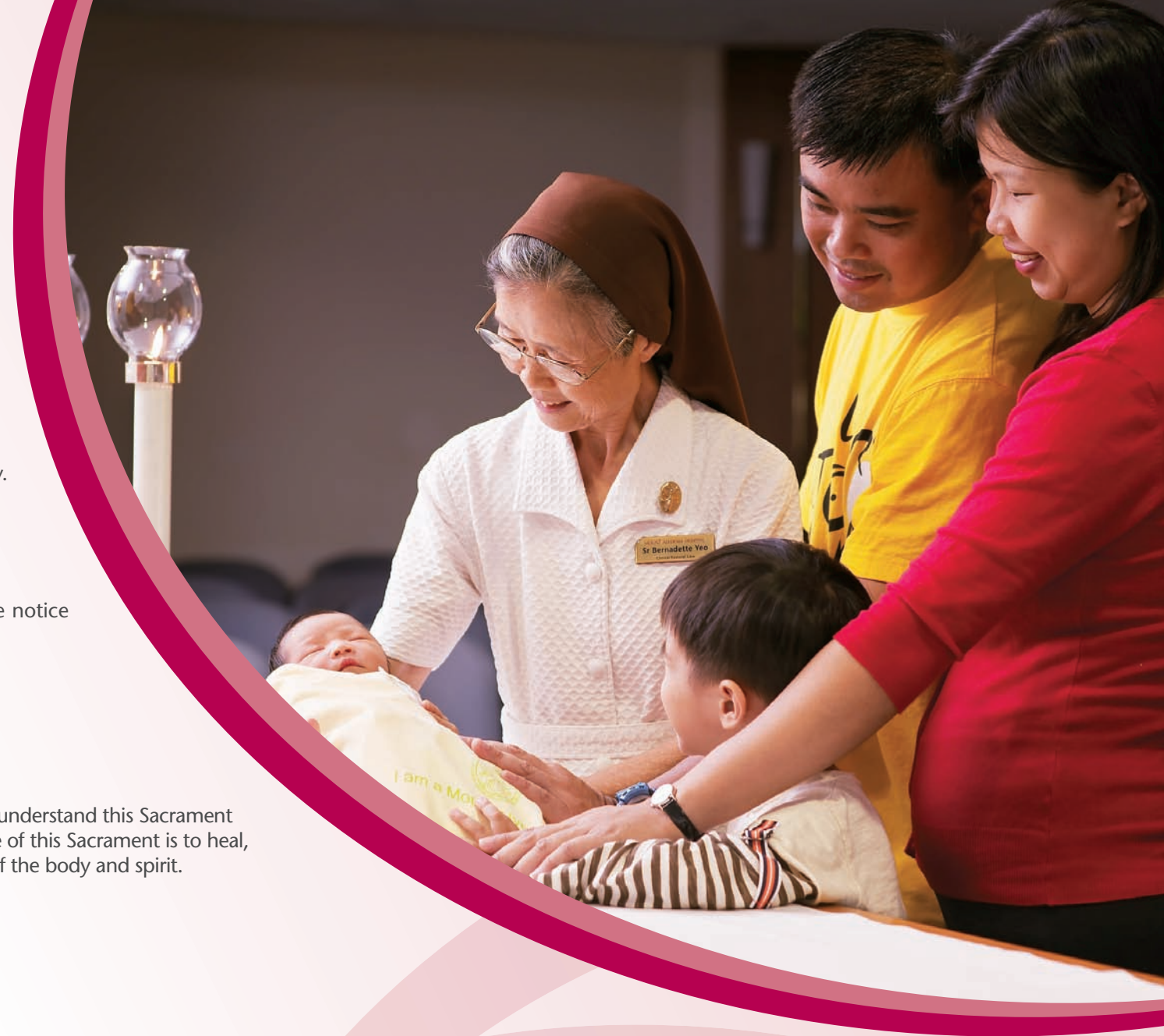
Above: Baby presentation of newborn at Mount Alvernia Chapel